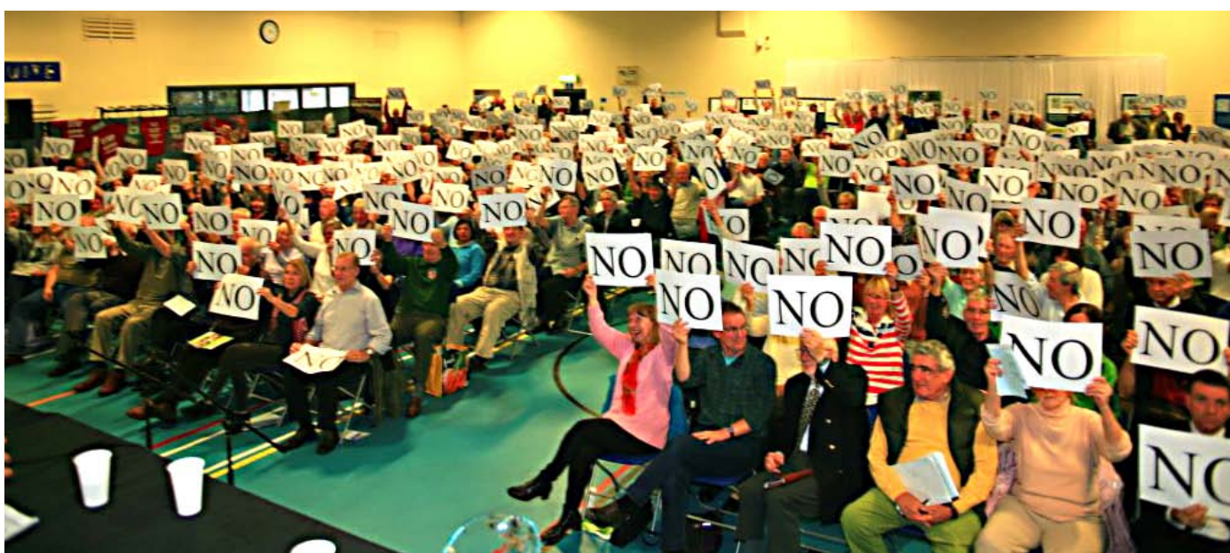
Five Members of Parliament were on the platform, and three more sent messages of support, at a mass protest meeting on Saturday 22 November 2014 organised by the Gatwick Area Conservation Campaign (GACC).